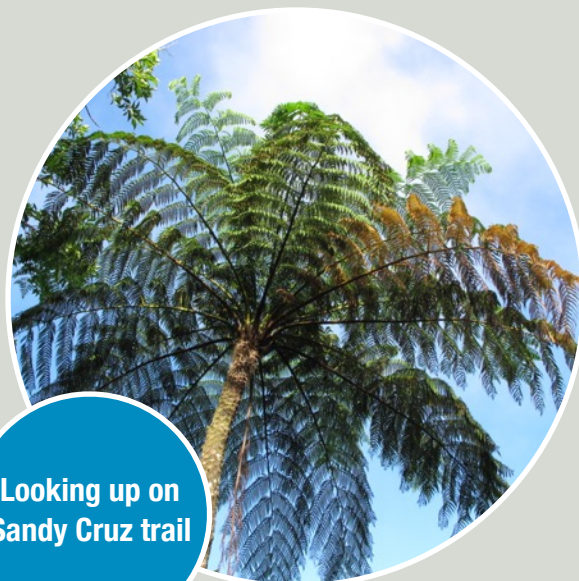
Looking up on Sandy Cruz trail

Divers will find that 5-7 days combining hiking and diving makes for a great vacation. For those who do not dive I suggest 4-5 nights giving enough time to complete the best hikes and experience the island. The remaining time might be spent on St. Maarten or one of the other nearby less crowded islands (Statia, Anguilla, or St. Bart's). Regardless of whether you stay at the more upscale Queens Gardens or Shearwater, or a very basic small