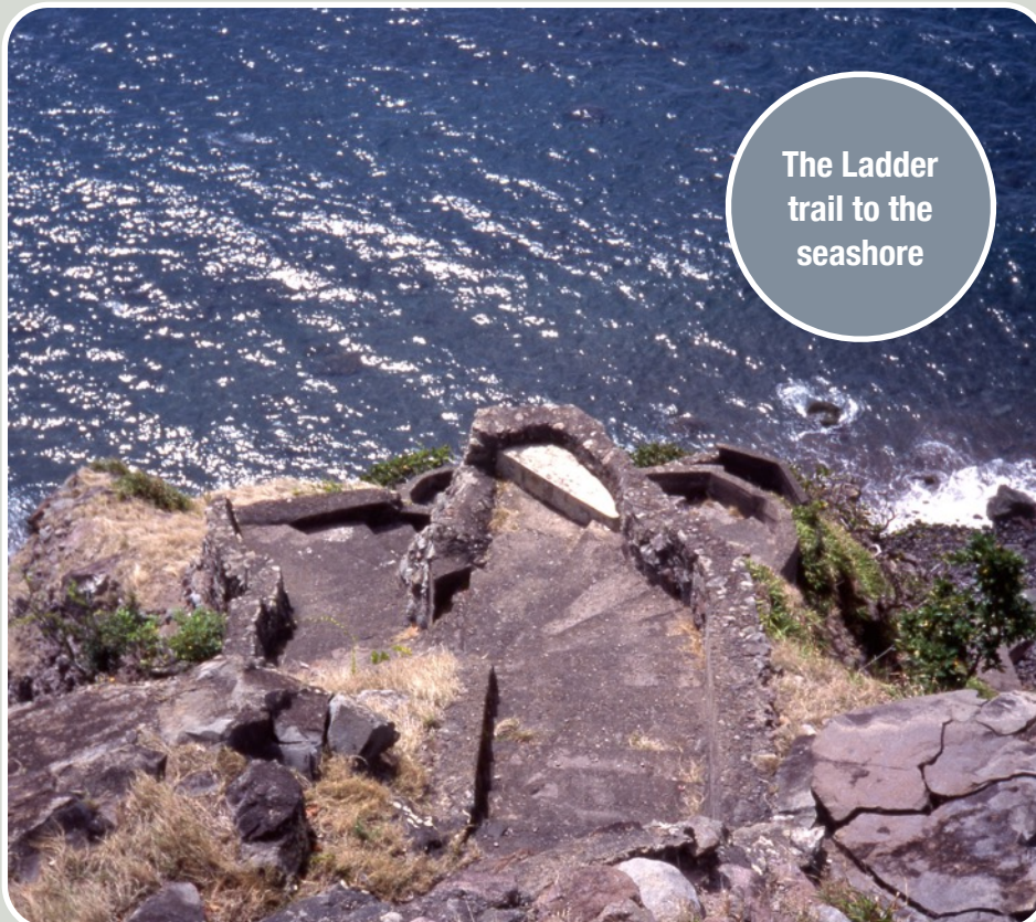
The Ladder trail to the seashore

list. Over a thousand hand-hewn steps help with the constant vertical ascent from the base in Windwardside, accessed from the Saba Trail Shop run by the Saba Conservation Foundation. For those wanting to lessen the strain taxis can take hikers to Rendezvous 20 minutes up the trail. If the day is sunny the views from the summit are unbeatable, with the Caribbean Sea and nearby islands in the distance and rainforest clad slopes extending to Windwardside directly below. The slopes are so steep and densely covered by forest that no one has ever set foot or hand on most of what lies near to the summit. On misty days the forest has a mystical aura with clouds swirling amongst trees covered in bromeliads, mosses and ferns. In this setting it is easy to envision