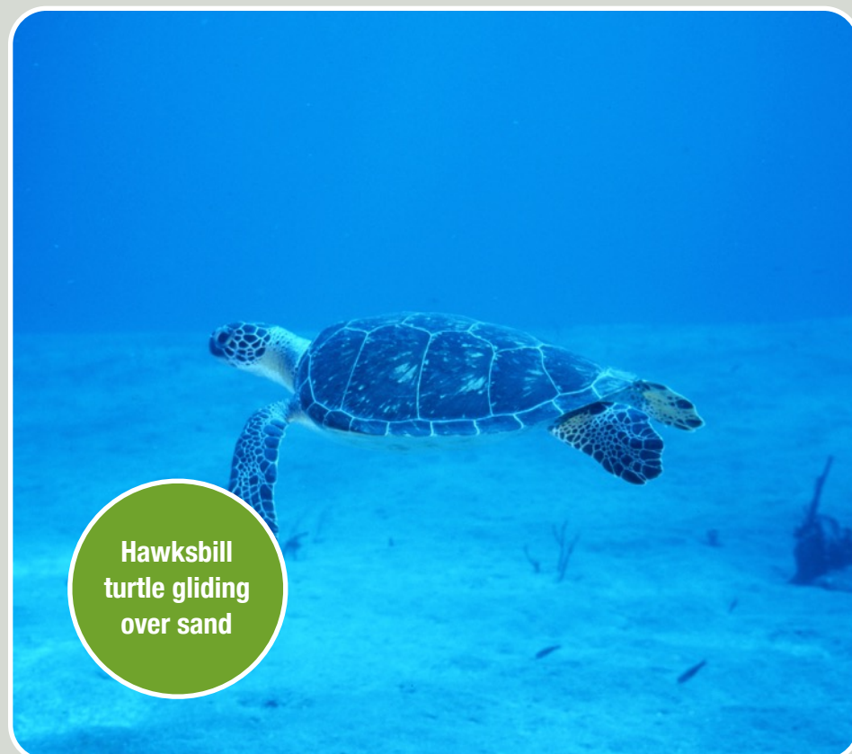
Hawksbill turtle gliding over sand

This tiny and truly unique island underwent no less than twelve changes in sovereignty throughout its colorful history with the English, Dutch, French and Spanish all claiming possession. Finally, in 1816 Saba became definitively